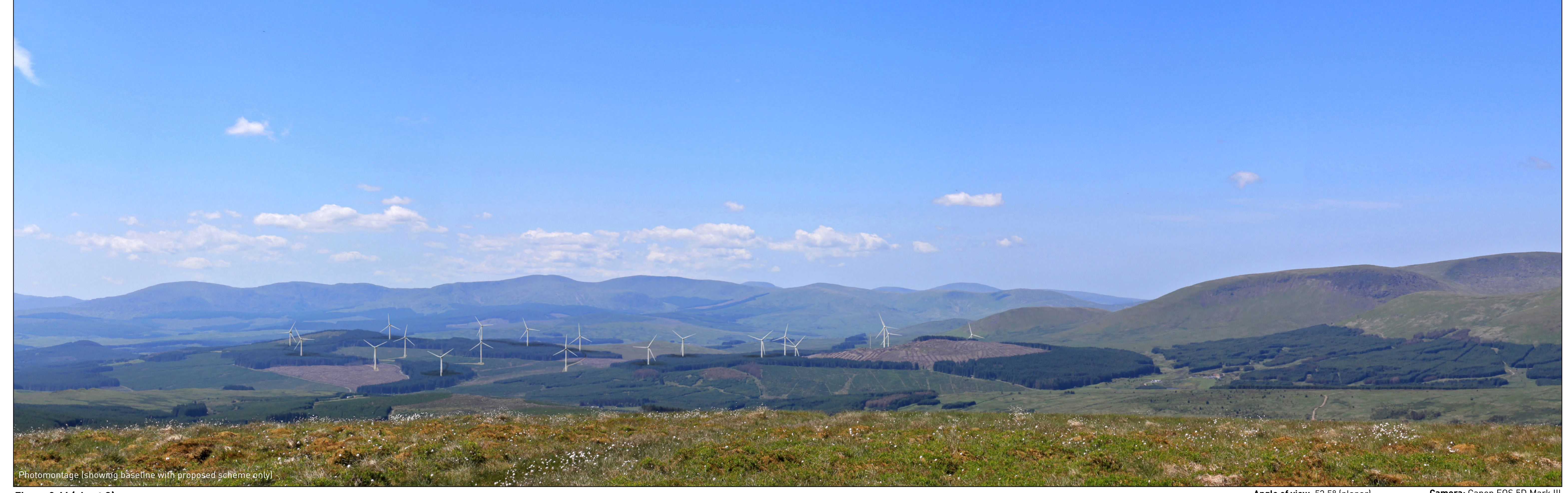
Figure 8.46 (sheet C) Viewpoint 10: Southern Upland Way, Benbrack (Striding Arch) SHEPHERDS' RIG WIND FARM